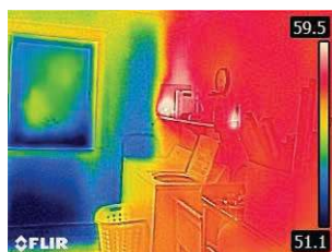
Uninsulated Outside Wall