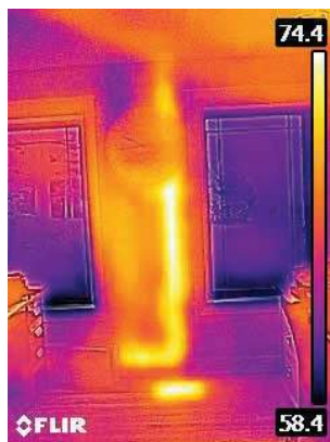
Warm Drain Pipe in Wall